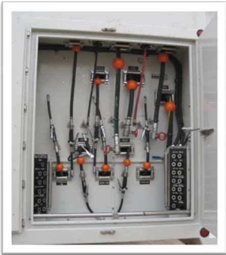
Product Dispensing Cabinet

Diesel fuel tanks available in carbon steel or aluminum.